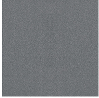
Fade to Gray - 12